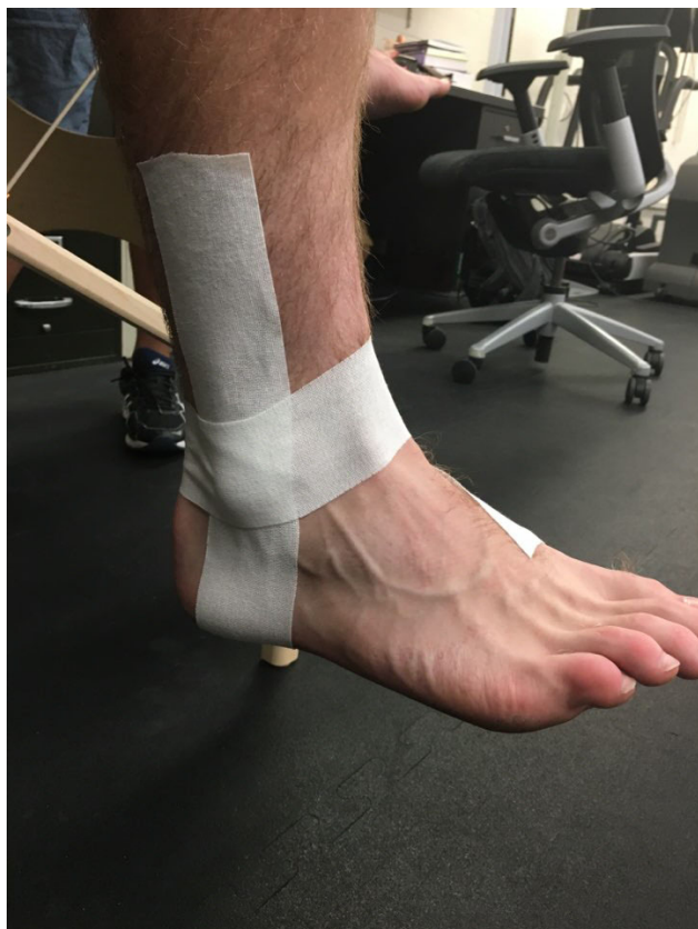
FIG. 4. Kinesiology taping. The kinesiology tape, an elastic tape, is utilized in accordance with Kase's KT manual in this study. The strip passes the lateral malleolus and is applied under the heel and ankle to the medial side. Then, it is passed around the anterolateral aspect of the ankle to the Achilles tendon. Finally, the strip is ended on the dorsal aspect of the foot after surrounding the ankle.

of the peroneus longus muscle in another study [43]. Based on these results, KT is not designed as an external support to restrict movement and increase muscle activation. Focusing on the effects of KT mentioned earlier, KT was applied to the CAI group, but no effect was observed. KT did not affect the ankle stability of muscles. Additionally, after 24–72 h of KT application to the vastus medialis origin to insertion, muscle activation was increased, and the peak torque value was maintained during isokinetic exercise; however, no effects were observed after 96 h. These effects continued after the removal of KT for 48 h [48]. However, as a result of performing the task 1 h after the taping application in this study, no significant clinical effects of KT were observed. In other words, the timing of KT application (before performing the task) may have influenced the findings of the current study. For these reasons, each joint with KT may not change according to the kinetic chain.