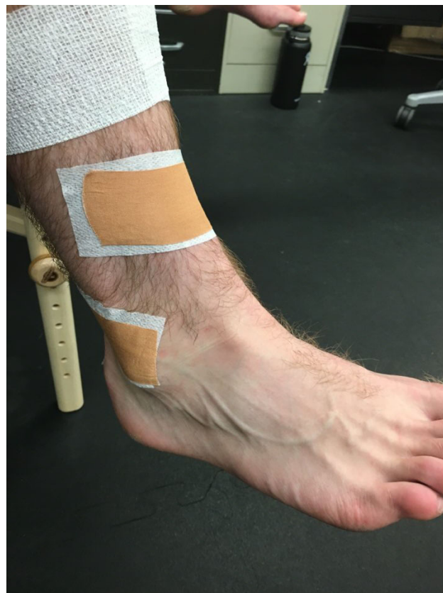
FIG. 3. Fibular repositioning taping. Leukotape P® (BSN Inc., Charlotte, NC, USA), a nonelastic tape, is utilized in this study. Q.D.A. Tape Adherent Spray (Q.D.A., Cramer Products, Inc., Gardner, KS 66030, USA) is used for better adhesiveness. It is applied obliquely around the lower leg and ended on the anterior aspect of the shin while applying the fibula glide.

A previous study showed that the plantar flexion of the CAI group with FRT was reduced in the IC phase during