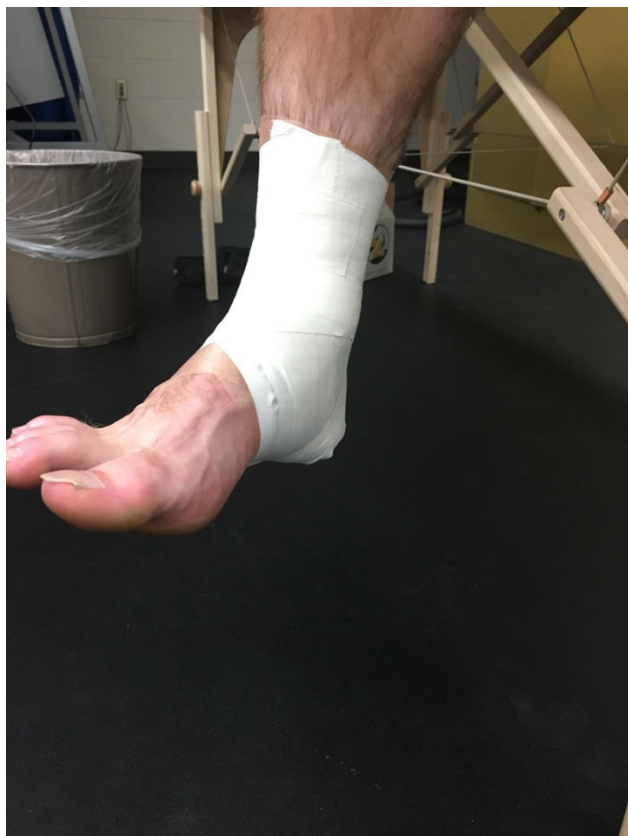
FIG. 2. Traditional taping. The Zonas traditional tape (Johnson & Johnson Sports Medicine), a nonelastic tape, is utilized in accordance with a closed basket-weave taping technique in this study.

Furthermore, the peak muscle activation of the rigid-taping group increased during the static test (standing with a single limb) and dynamic stability test (two-footed vertical jumps), although the difference was not significant [42]. Moreover, the peroneal muscle latency was considerably longer in the rigid taping group during the dynamic test [42]. Similarly, in another study, the muscle activation of the healthy group subjected to rigid taping increased compared with that of the KT group during a sudden inversion perturbation test [43]. This result can be explained by the fact that rigid taping may pull the skin more than elastic taping, thus increasing muscle activation. Despite the use of rigid and elastic taping, the lack of change in lower-extremity kinematics in this study may be attributed to the characteristics of the aforementioned tasks.